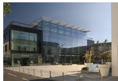
The Jubilee Library, site of the conference

shape in the future it will be updated to give more indications of the programme, but you can use it now to book your places. If you don't use the internet, please feel free to phone the office and we'll be happy to arrange it for you. The website already contains a list of nearby hotels for those of you who want to make reservations early. A paper aliĝilo will come with the next issue of Update.