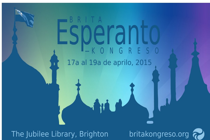
The Jubilee Library, Brighton

We look forward to seeing you in Brighton!