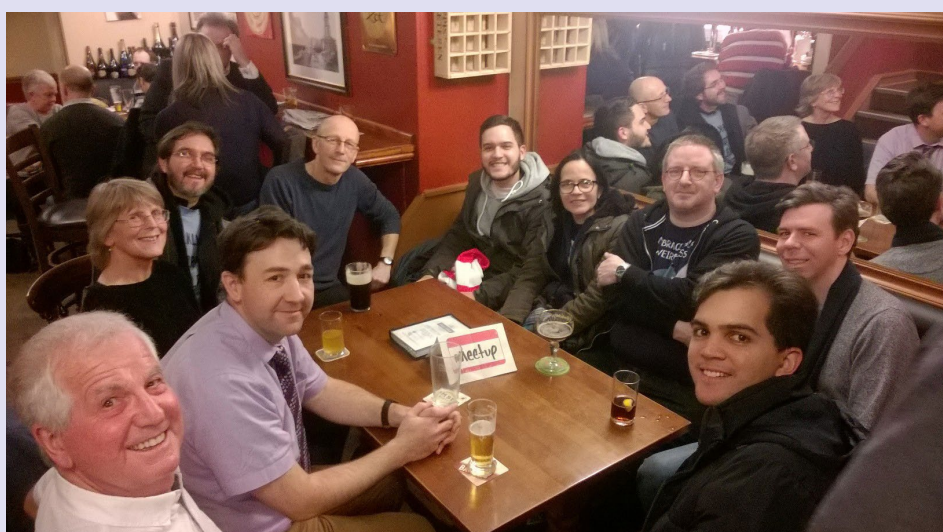
The Birmingham Meetup group meeting in Wolverhampton in December 2017, including people from Italy, Iran, Australia, Poland and Brazil.